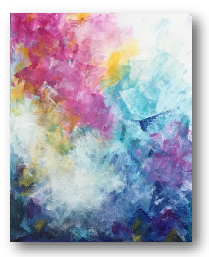
Acrylic wall art by Jill Allanson

ART IN THE MAKING ENCOMPASSES A FABULOUS ARRAY OF UNIQUE HANDCRAFTED CREATIONS INCLUDING: