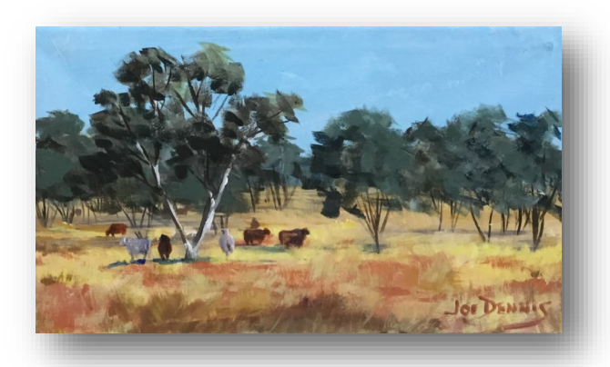
Acrylic wall art by Joe Dennis